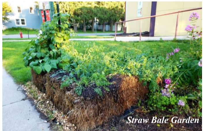
Straw Bale Garden